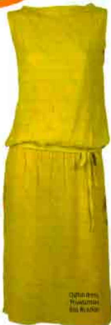
Organic, Prayadashini, Rs. 4,500