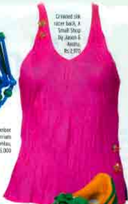
Crushed silk racer back, A Small Shop by Jason & Anita, Rs. 2,970