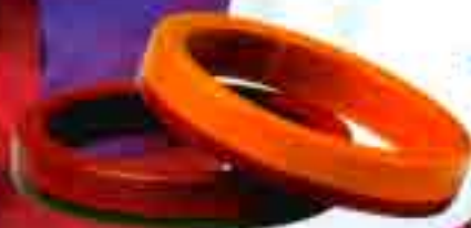
Wooden bangles, Gheetha, Rs. 150 each