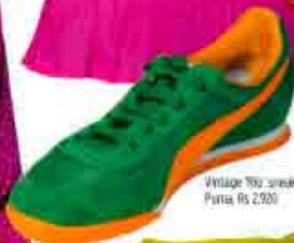
Vintage Puma sneakers, Puma, Rs. 2,920